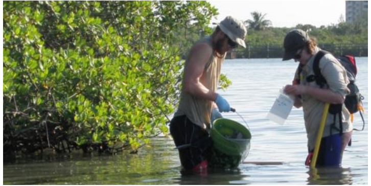
Collection of sediment and the clam Phacoides pectinatus in Fort Pierce, FL.